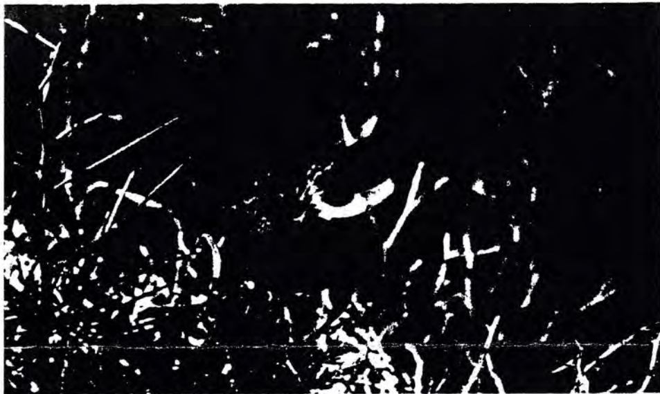
The white winged fairy wren ( Malurus leucopterus ) was once common along the metropolitan coast but is now restricted to heath on large reserves such as Trigg.

unes. Like the Cypress it is killed by fire and as a result is naturally uncommon in the metropolitan area. Both species have the potential as windbreaks in coastal gardens.