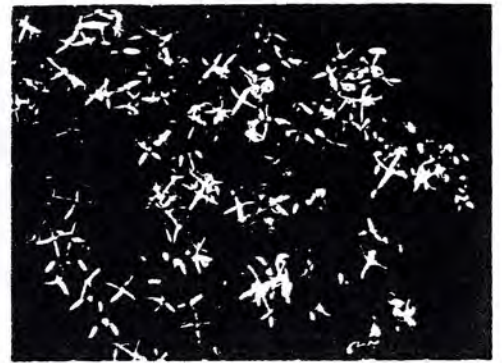
Clematis microphila is a creeper common throughout the Reserves. It has white feathery seeds which give it its common name, old man's beard.