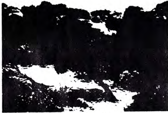
Strong sea breezes have molded the growth of these Rottneest Island Cypress ( Callitris preissii ).